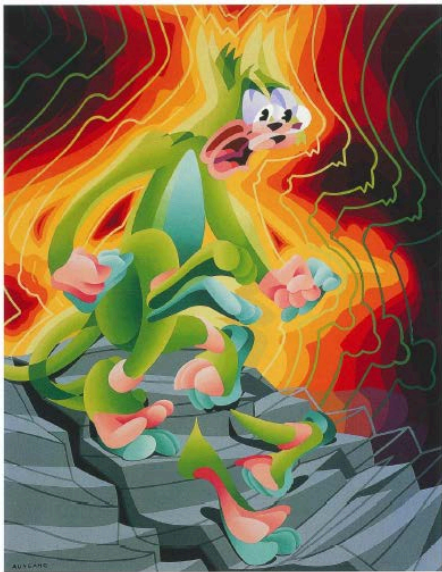
DUDE DESCENDING A STAIRCASE