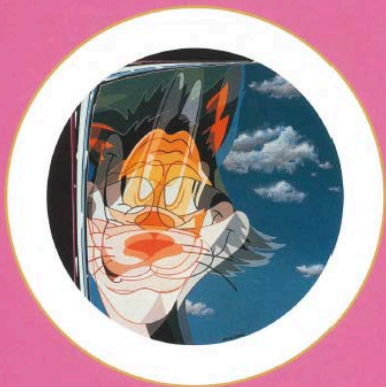
THE WINDOW WASHER