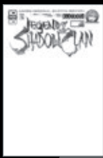
Original Sketch Edition