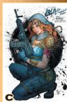
C RETAILER INCENTIVE EDITION BY - DAWN McTEIGUE & SIYA OUM