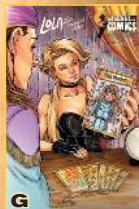
G A FISTFUL OF COMICS EXCLUSIVE LIMITED EDITION OF 100 WWW.AFISTFULOFCOMICS.COM BY - SIYA OUM

LOLA XOXO CREATED BY SIYA OUM WASTELAND MADAM CREATED BY SIYA OUM & VINCE HERNANDEZ