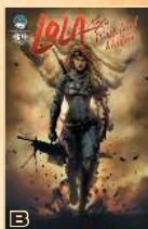
B DIRECT EDITION BY - LORI "CROSS" HANSON & SIYA OUM