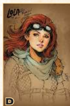
D RETAILER INCENTIVE SKETCH EDITION BY - SIYA OUM