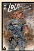
A DIRECT EDITION BY - SIYA OUM