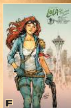
F SKETCH COVER EDITION BY - SIYA OUM