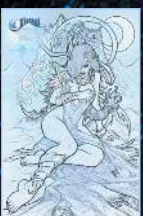
Bluearabow Online Sketch Exclusive Limited Edition of 100 BY PAOLO PANTALENA