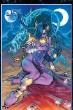
Bluearabow Online Exclusive Limited Edition of 200 BY PAOLO PANTALENA & PETER STEIGERWALD