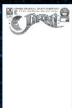
Original Sketch Edition