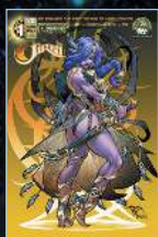
Special Reserved Edition BY PAOLO PANTALENA & PETER STEIGERWALD