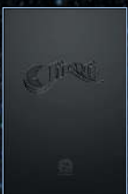
10th Anniversary Edition