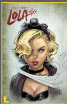
L GOTHAM CENTRAL COMICS EXCLUSIVE LIMITED EDITION OF 250 WWW.GOTHAMCENTRAL.CA BY - SIYA OUM