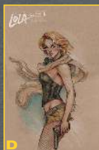
D RETAILER INCENTIVE LIMITED EDITION BY - SIYA OUM