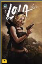
B DIRECT EDITION BY - SIYA OUM