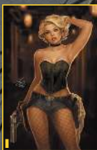
I BLUERAINBOW ONLINE EXCLUSIVE LIMITED EDITION OF 500 WWW.BLUERAINBOW.COM BY - SIYA OUM