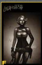
F WONDERCON ANAHEIM 2014 LIMITED EDITION OF 500 BY - SIYA OUM