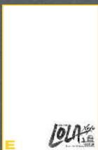
E SKETCH COVER EDITION