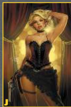
J BLUERAINBOW ONLINE EXCLUSIVE LIMITED EDITION OF 100 WWW.BLUERAINBOW.COM BY - SIYA OUM