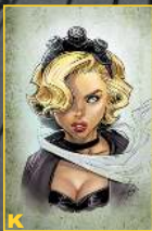
K GOTHAM CENTRAL COMICS EXCLUSIVE LIMITED EDITION OF 250 WWW.GOTHAMCENTRAL.CA BY - SIYA OUM