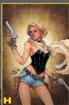
H KUPPER'S COMICS EXCLUSIVE LIMITED EDITION OF 250 WWW.KUPPERSWORLD.COM BY - SIYA OUM