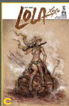
C RETAILER INCENTIVE EDITION BY - SIYA OUM