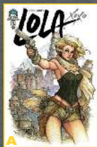
A DIRECT EDITION BY - SIYA OUM