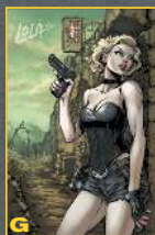
G CALGARY EXPO 2014 LIMITED EDITION OF 500 BY - SIYA OUM