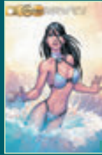
Comic-Con International San Diego 2015 Exclusive Aspen Century Edition Limited Edition of 100 by - MICHAEL TURNER & PETER STEIGERWALD