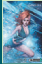
Amazing! Las Vegas 2015 Exclusive Limited Edition of 200 by - ERIC "eBAS" BASALDUA & PETER STEIGERWALD