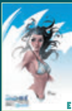
Supanova Pop Culture Expo Sydney 2015 Exclusive Limited Edition of 300 by - MICHAEL TURNER & PETER STEIGERWALD