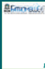
Vet Tix Sketch Exclusive Limited Edition of 50 www.VetTix.org